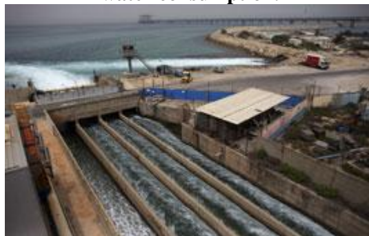
Desalination plant in Hadera, May 2010

On completion of the Ashdod plant, desalination plants will supply around 75% of the domestic water consumption.