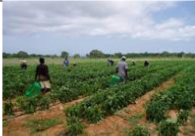
Irrigation projects in Africa are a main focus of the activities of MASHAV.

Since its founding in 1948, Israel has had a thirst to grow crops in the desert. It wasn't just a technological challenge, but a matter of survival. Today, Israel offers some of the world's hottest technologies in desalination, water reclamation and crop irrigation.