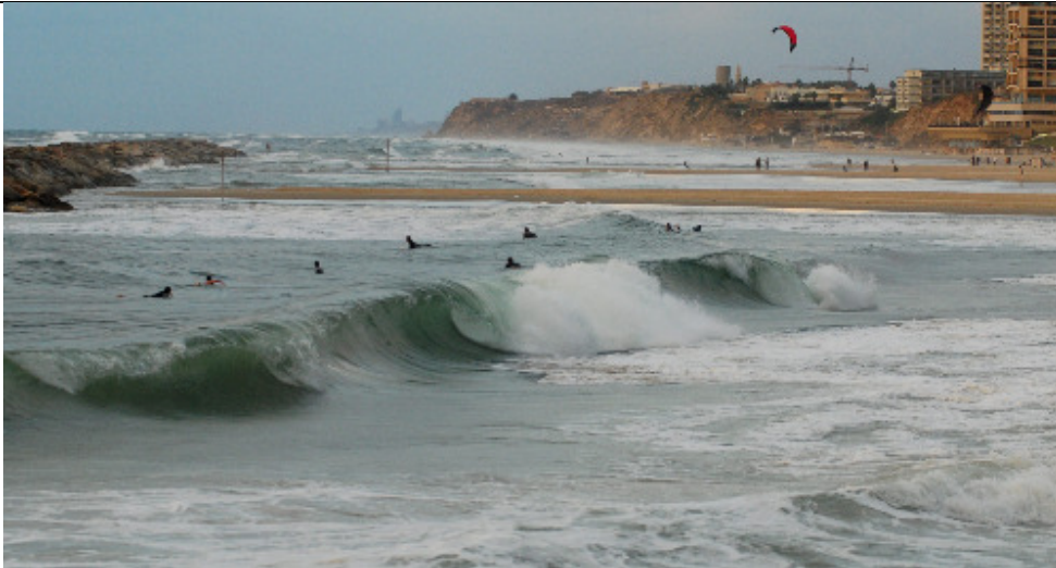
Photo by Gili Yaari/Flash 90 (Israel21c) – Beach in Herzliya, Israel

September 26, 2010 - With 186 miles of sandy beaches, and a sea that is virtually free of seaweed and sharks, Israel is a great spot for surfers, say the country's experts. ISRAEL21c picks the top 10 beaches.