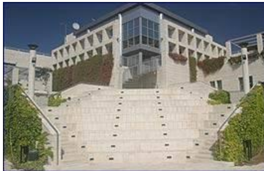
The Rabin Youth Hostel in Jerusalem, located a stone's throw from the Knesset and the Israel Museum.

Israel is investing in expanding the network of high-quality hostels that offer an affordable alternative to traveling families and groups.