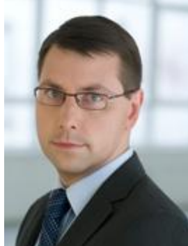
Picture: Lithuanian Minister of Education and Science Gintaras Steponavičius

Lithuanian Minister of Education & Science Gintaras Steponavičius to participate in the EUREKA 25th Anniversary Event, taking place in Jerusalem, June 22-23, 2011, and the 3 rd annual Conference under the auspices of the President of the State of Israel, Mr. Shimon Peres, Facing Tomorrow 2011, taking place in Jerusalem, June 21-23, 2011.