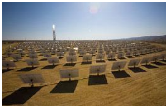
Solar energy companies like Israel's Brightsource, attract a great deal of international attention.

The 15 th annual CleanTech Expo in July will highlight Israel’s solutions for the energy and water needs of Brazil, Russia, India and China.