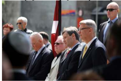
Photo from the Holocaust victims commemoration ceremony - July 4, 2011