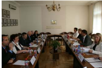
Picture from the meeting between Israeli Tourism Minister S.Misezhnikov and Latvian Minister of Economy A.Kampars

Israeli Tourism Minister Stas Misezhnikov pays official visit to Latvia and Lithuania.