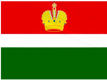
Flag of the Kaluga Region