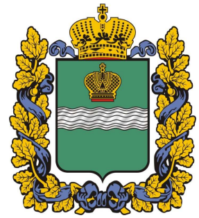
Coat of arms of the Kaluga Region