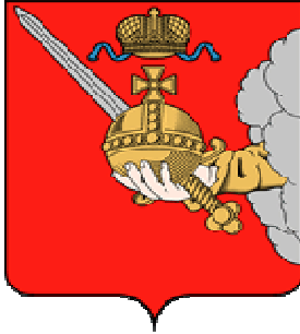
Flag of the Vologda Region