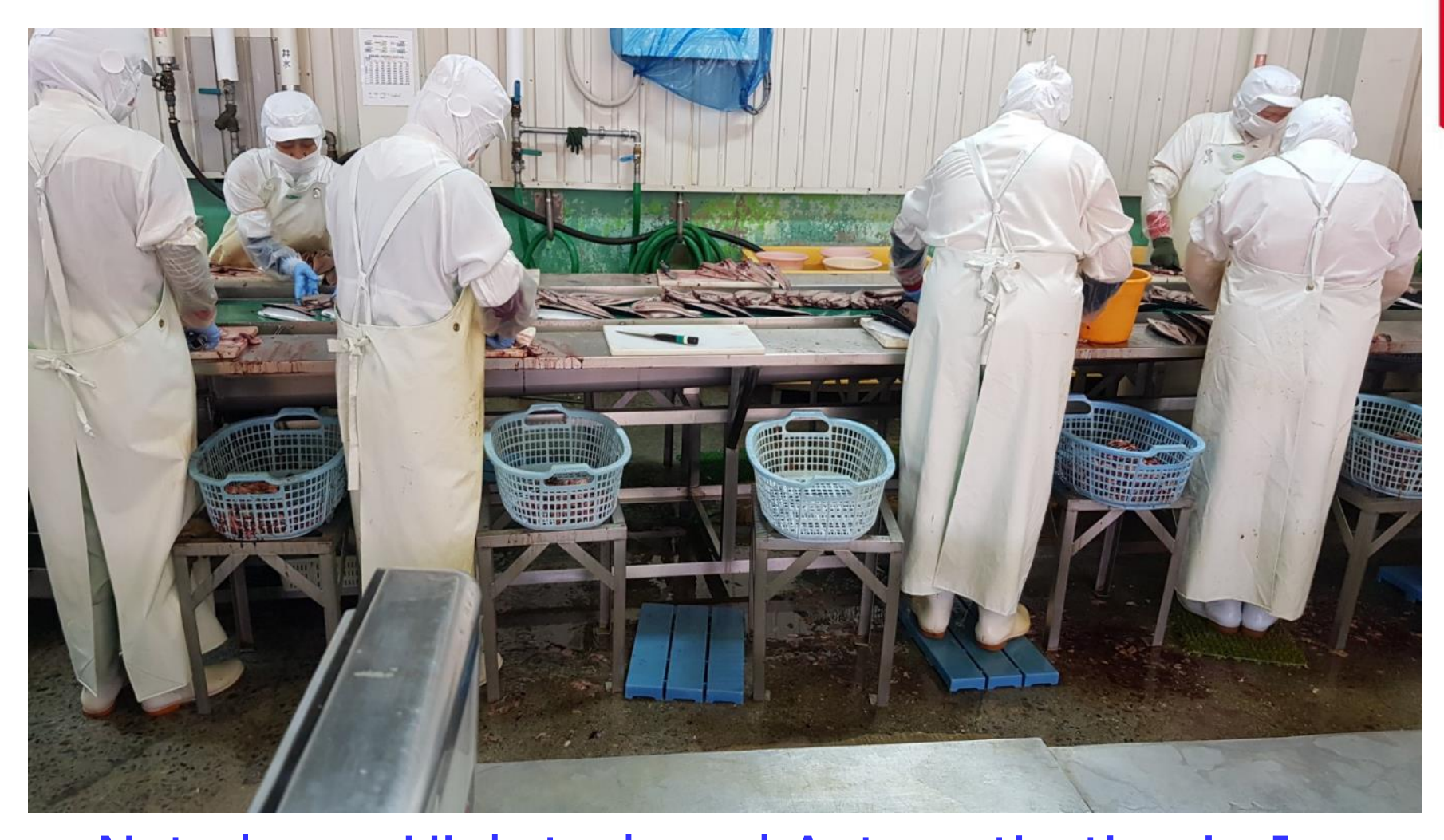
Not always High-tech and Automatization in Japan Here we can deliver!