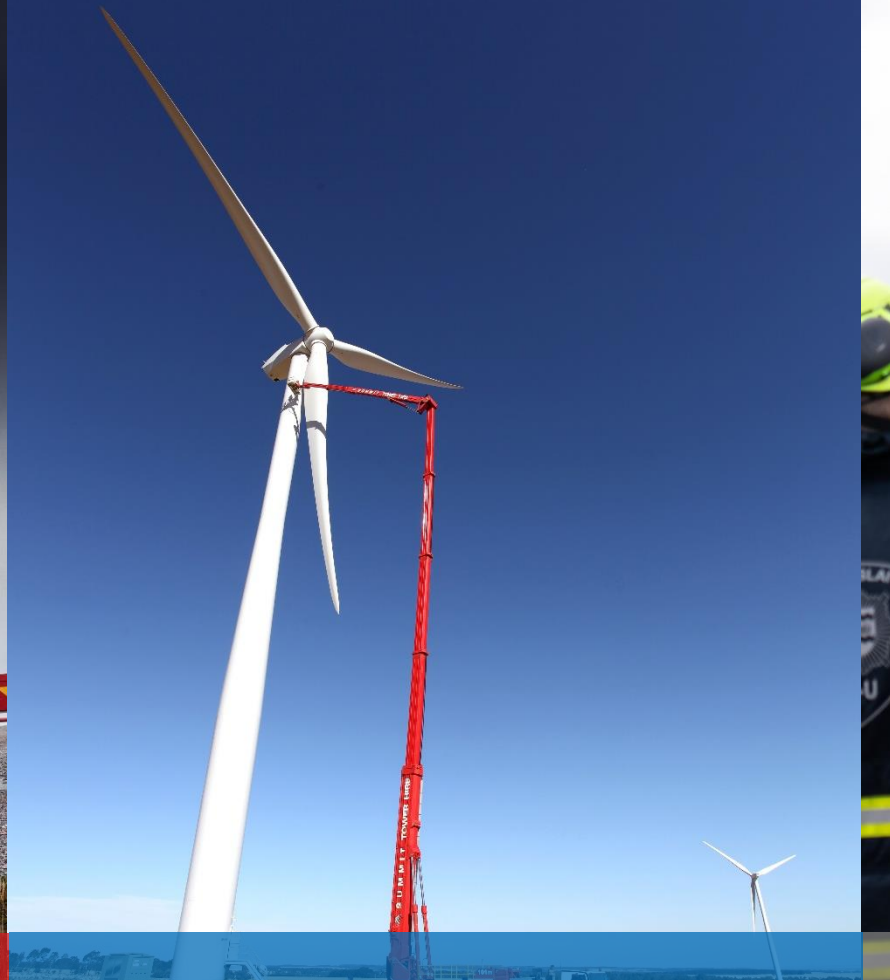
Industrial access platforms