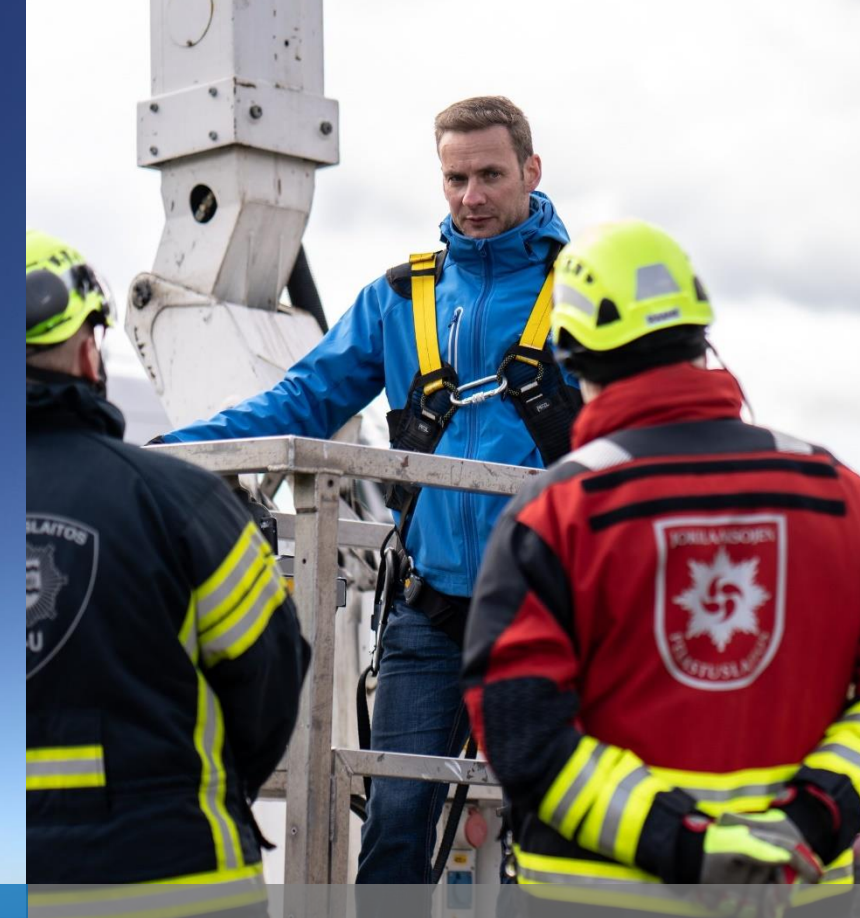
Service and maintenance