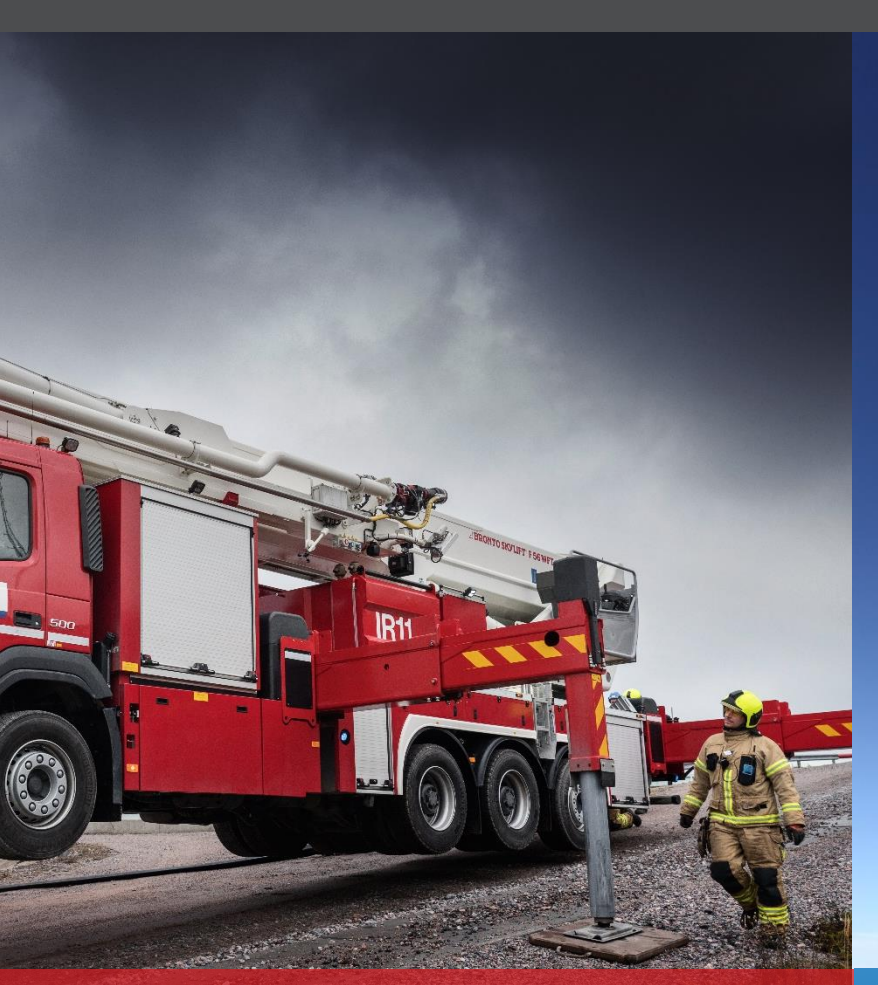
Fire fighting and rescue platforms